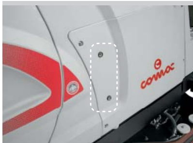
Fluid level indicator (version with CDS)

Thanks to the CDS Comac water and detergent dosing system, solution saving up to 50% is ensured.