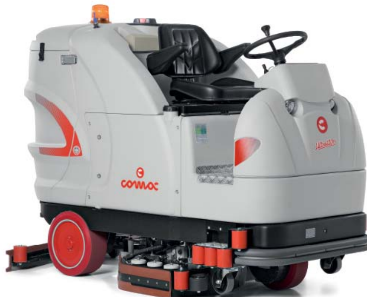
Ultra 120 B

Ultra scrubbing machines are equipped as standard with an antiskid wheel and with a speed reduction device on bends, traction with A.C. control and carbon brushless motor.