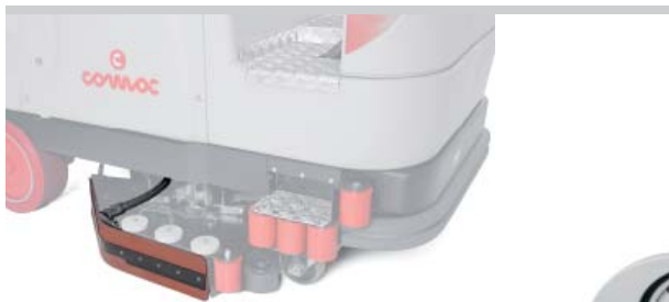
Suction system located on the brush head

The "V" shaped side splash guards system on the brush head was designed to convey the detergent solution into the centre: this made it possible to install a compact squeegee that can guarantee, thanks to the "V" shaped splash guards, perfect drying even on bends.