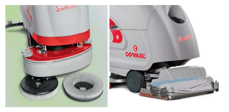
On both scrubbing versions (Simpla 50/55/65) and the sweeping version (Simpla 50 BS) it's very easy to replace brushes without specialised personnel