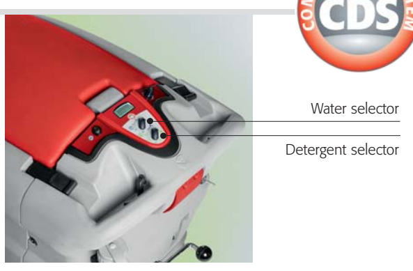
Separate water and detergent management