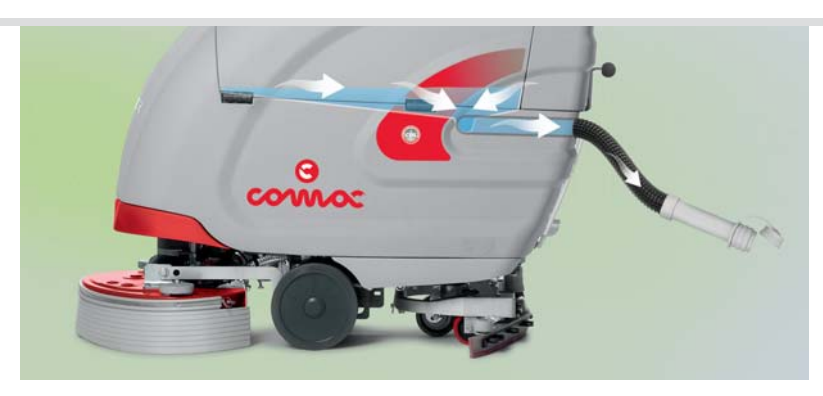
Thanks to its special design and to the large drain hose, the recovery tank can be completely emptied