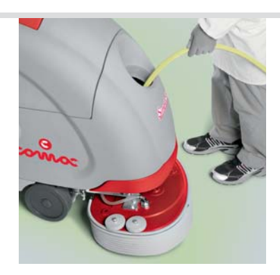
Thanks to the wide inlet it is very easy to fill the tank

Furthermore, their technical and design devices make the machine extremely reliable and efficient.