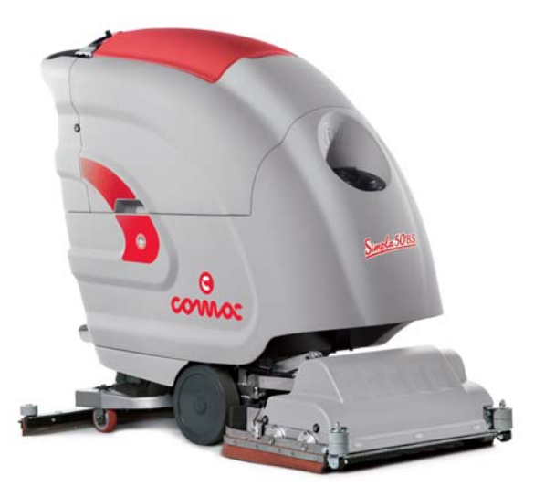
Simpla 50 BS is the sweeping version of the Simpla family. It has a debris hopper to collect small solid waste

The manual adjustment by means of a cock used on traditional scrubbing machines does not grant the rightr flow rate nor a constant deliver as the tank empties. We often use more water and detergent than needed - from 30 to 50%. CDS is the new water and detergent dosing system made by Comac enabling the operator to dose water and detergent separately, thanks to 2 separate selectors.