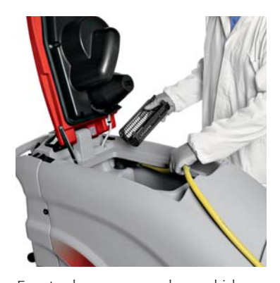
Easy to clean squeegee hose which, if cleaned regularly, helps to keep suction efficiency