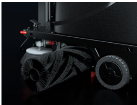
Productive start to finish Wide cleaning path, large debris hopper, and speed combine to get the job done fast.