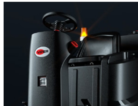
Built with safety in mind Help reduce employee and property risks with the safety-minded design

Nilfisk, Inc. 9435 Winnetka Avenue North Brooklyn Park, MN 55445 www.nilfisk.us Phone 800-989-2235 Fax 800-989-6566